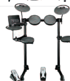
ROLAND TD-25K-S ELECTRONIC DRUM KIT (439796)