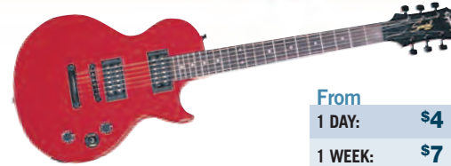
EPIPHONE ELECTRIC GUITARS