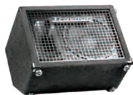
TRAYNOR BLOCK SERIES 200w KEYBOARD AMP

BLOCK10 1 DAY: $7 1 WEEK: $14 1 MONTH: $27