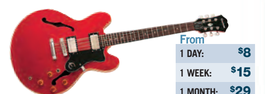
EPIPHONE SEMI HOLLOW ELECTRICS