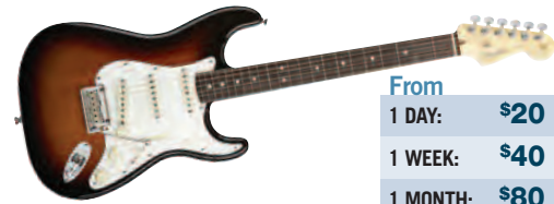
FENDER AMERICAN STANDARD STRATS AND TELES