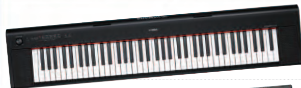
YAMAHA NP-32B 76-KEY ELECTRIC PIANO (0477740)