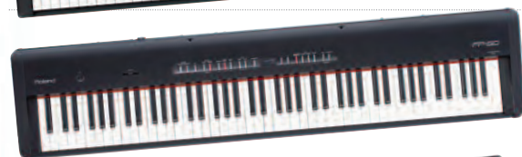
ROLAND FP-50-BK 88-KEY DIGITAL PIANO (394266)