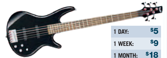
IBANEZ GSR205BK-5 5 STRING BASS (59089)