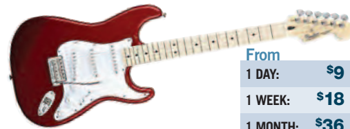
FENDER STANDARD STRATS AND TELES