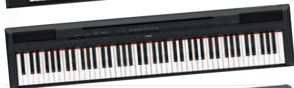
YAMAHA P115B 88-KEY DIGITAL PIANO (376937)