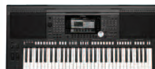
YAMAHA PSR-S970 ARRANGER KEYBOARD (0446145)

BLOCK12 1 DAY: $8 1 WEEK: $15 1 MONTH: $30