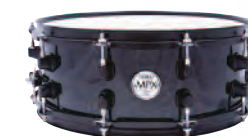
MAPEX MPX-MK14D STUDENT SNARE KIT WITH BACKPACK (365920)