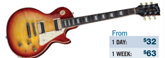
GIBSON LES PAULS