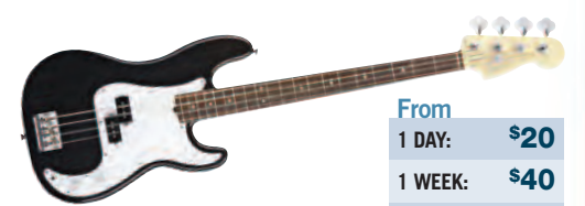
FENDER AMERICAN BASES