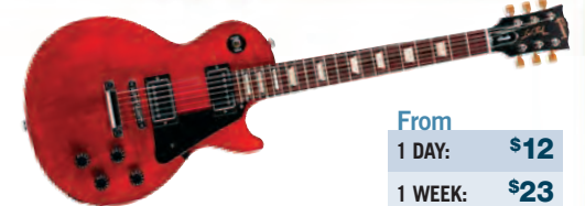
GIBSON LES PAUL STUDIOS