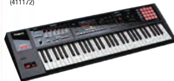
ROLAND FA-06 61-KEY MUSIC WORKSTATION (411172)