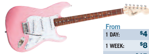
SQUIER ELECTRIC GUITARS