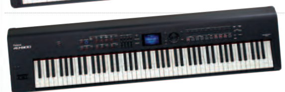
ROLAND RD-800 88-KEY DIGITAL STAGE PIANO (410631)