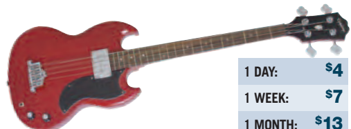
EPIPHONE EB-0 SHORT SCALE BASS (67323)