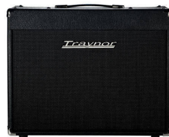
Custom Valve 50W 1x12" Combo Amp