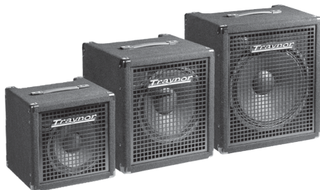
120W 1x10" Bass Combo Amp *