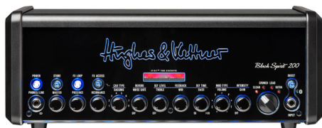
Black Spirit 200 Guitar Head