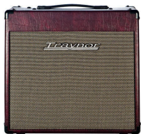
Custom Valve 20W 1x12" Combo Amp in Wine Red