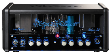
TubeMeister Deluxe 20 Head