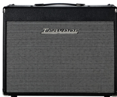
Custom Valve 40W 1x12" Combo Amp