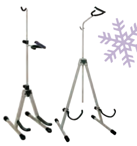
Ingles Violin Stand & Bow Holder SA-20 i 179083

Reg: $38.25 Special $29.95 Ingles Cello or Bass Stand