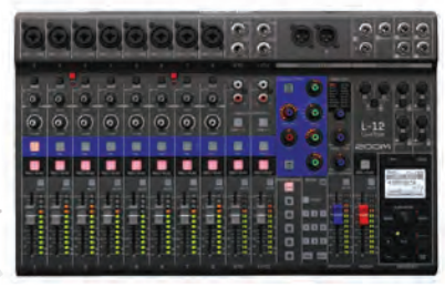
Zoom 12-Channel USB Digital Mixer/Recorder with FX LIVETRAK L-12 i 508895 $779.99