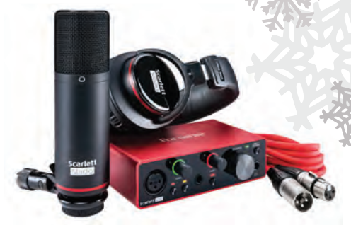
Focusrite Scarlett Solo Studio 3rd Generation with Condenser Mic & HP60 Headphones SCARLETTSSTUDM3 : 713670 $299