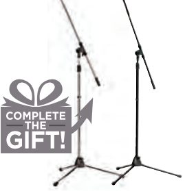
Yorkville Tripod Non-Telescopic Boom Mic Stand - Chrome MS-206 | 320836