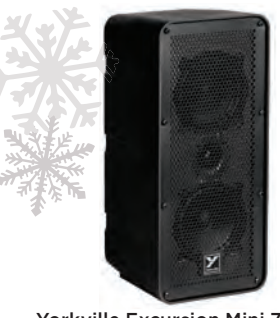
Yorkville Excursion Mini 70w Compact PA System EXM70 | 457128 $499