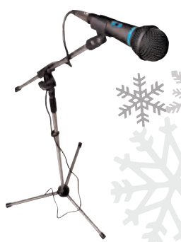
Apex Mic Pack

Everything the aspiring singer needs! Includes Apex 870 vocal mic, 20' XLR cable, and tripod boom stand and clip.