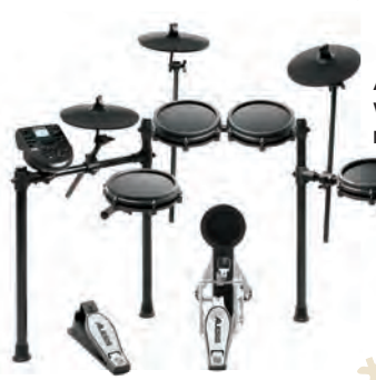
Alesis 8-Piece Electronic Drum Kit with Mesh Pads NITRO MESH KIT 1 693522 $529