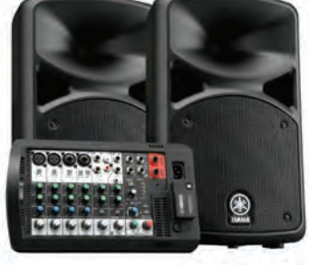
Yamaha STAGEPAS Portable PA System with Bluetooth

STAGEPAS400BT i 525767 400w / 8-channel mixer