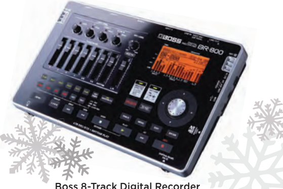
Boss 8-Track Digital Recorder BR-800 i 321957 Reg: $629.99 Special $429