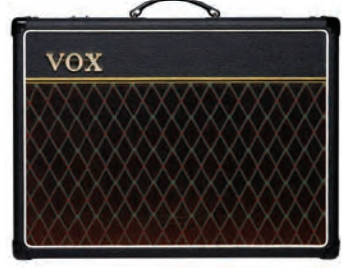
Vox 15w 1x12 Tube Combo AC15C1 : 317747 $899.99

VISIT LONG-McQUADE.COM AND ENTER THE CODE IN THE SEARCH FIELD TO FIND MORE PICTURES, DETAILS, AND DEMOS!